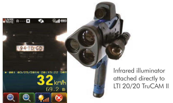
Infrared illuminator attached directly to LTI 20/20 TruCAM II

Continue to enforce violations throughout the night by using the side-mounted infrared illuminator.